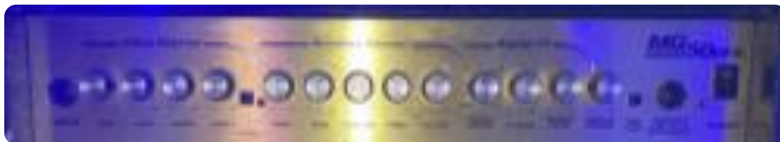
MARSHALL COMBO AMP (MG SERIES, 50DFX)