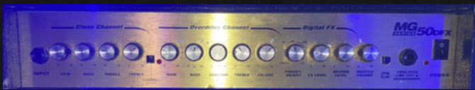
MARSHALL COMBO AMP (MG SERIES, 50DFX)